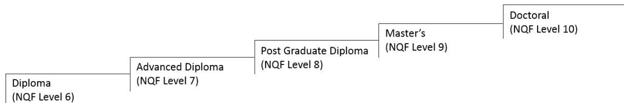
Figure 1: Progression pathway for Diploma students

Below is an example of new Vocational progression pathway from a Diploma up to the Doctoral level . The majority of TUT students are in the Diploma qualifications.