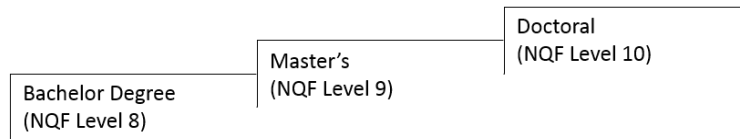
Figure 3: Progression pathway for Professional Bachelor degree (NQF Level 8) students

Below is an example of new generic Professional pathway from a Professional Bachelor degree (NQF level 8) up to the Doctoral level.